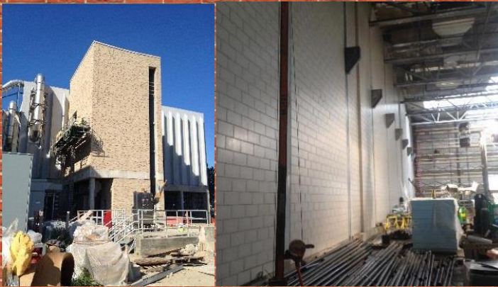
DC Water FDF

Point of Contact: Tony Barton, (202) 330-6096