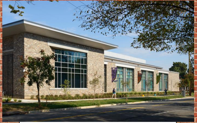
Brookland Middle School

2808 Douglas Street NE Washington D.C. 20018