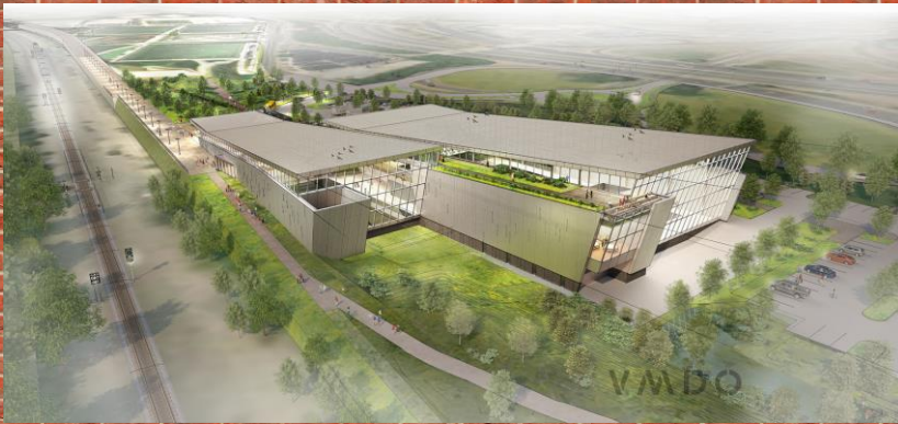
Long Bridge Park

Project Address: 313 Long Bridge Dr Arlington, VA 22202