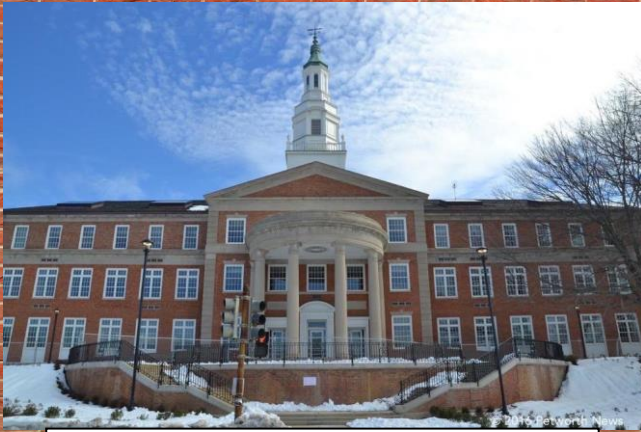
Roosevelt High School

Project Address: 4301 13 th Street, NW Washington DC