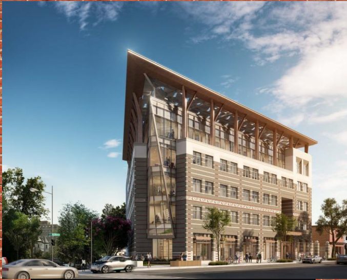
American Geophysical Union

Project Address: 200 Florida Ave NW Washington, DC 20009