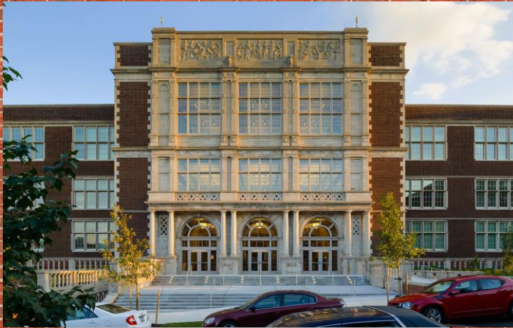
Cardozo High School

Project Address: 1200 Clifton Street NW, Washington, DC 20009