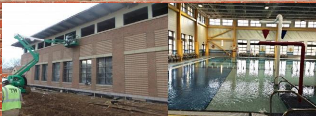
Barry Farms Recreation Center