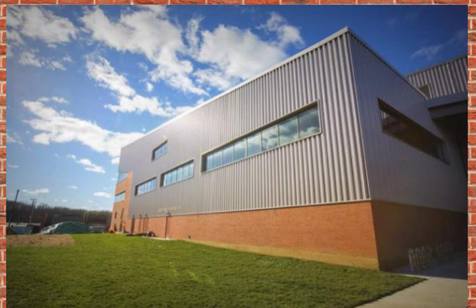
Queen Anne Hall