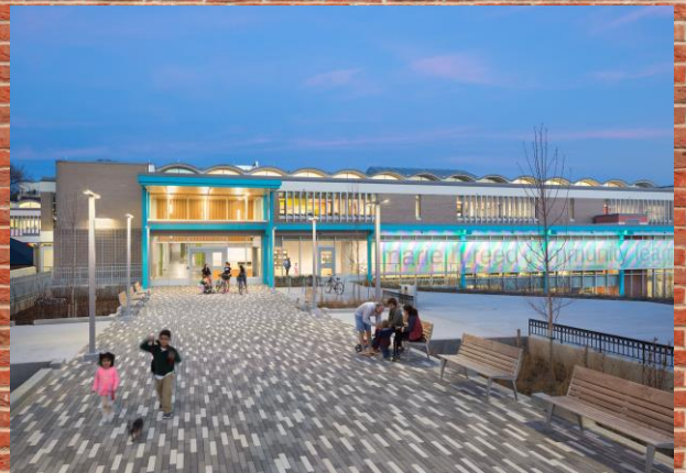
Marie Reed Elementary School