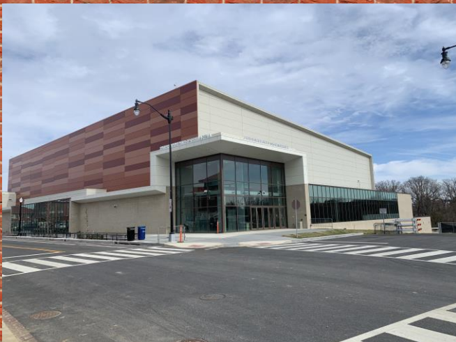
DC Entertainment and Sports Arena