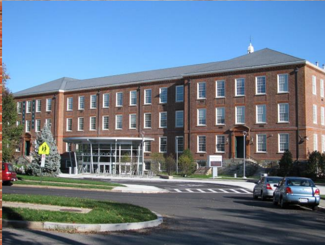
Woodrow Wilson High School